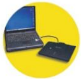
EXTENDED LIFE BATTERY

Basket - for hanging file folders. Battery Holder - fits an extended life battery for the laptop.