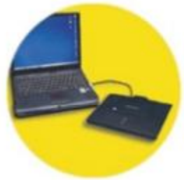
EXTENDED LIFE BATTERY

Basket - for hanging file folders. Battery Holder - fits an extended life battery for the laptop.