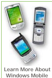
Learn More About Windows Mobile